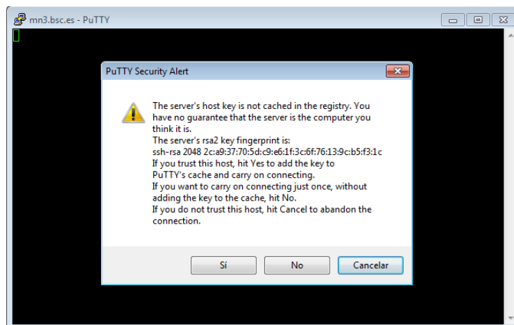
Figure 2: Putty certificate security alert

This is the first window that you will see at putty startup. Once finished, press the Open button. If it is your first connection to the machine, you will get a Warning telling you that the host key from the server is unknown, and will ask you if you are agree to cache the new host key, press Yes.